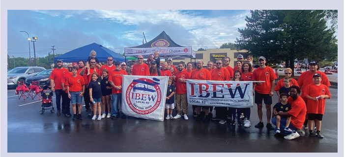
IBEW Local 82 marches in the Kettering Holiday At Home Parade on Labor Day 2022!